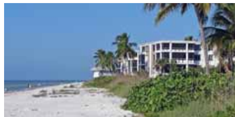
AWP vinyl windows are tested and certified to meet Hurricane-Impact Codes and are superior in corrosive, coastal environments.